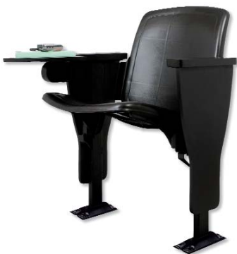
BQ 700 CAMPUS