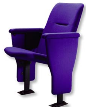
BE 700 ADRIATIC