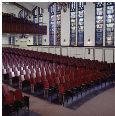
HILLSBOROUGH HIGH SCHOOL