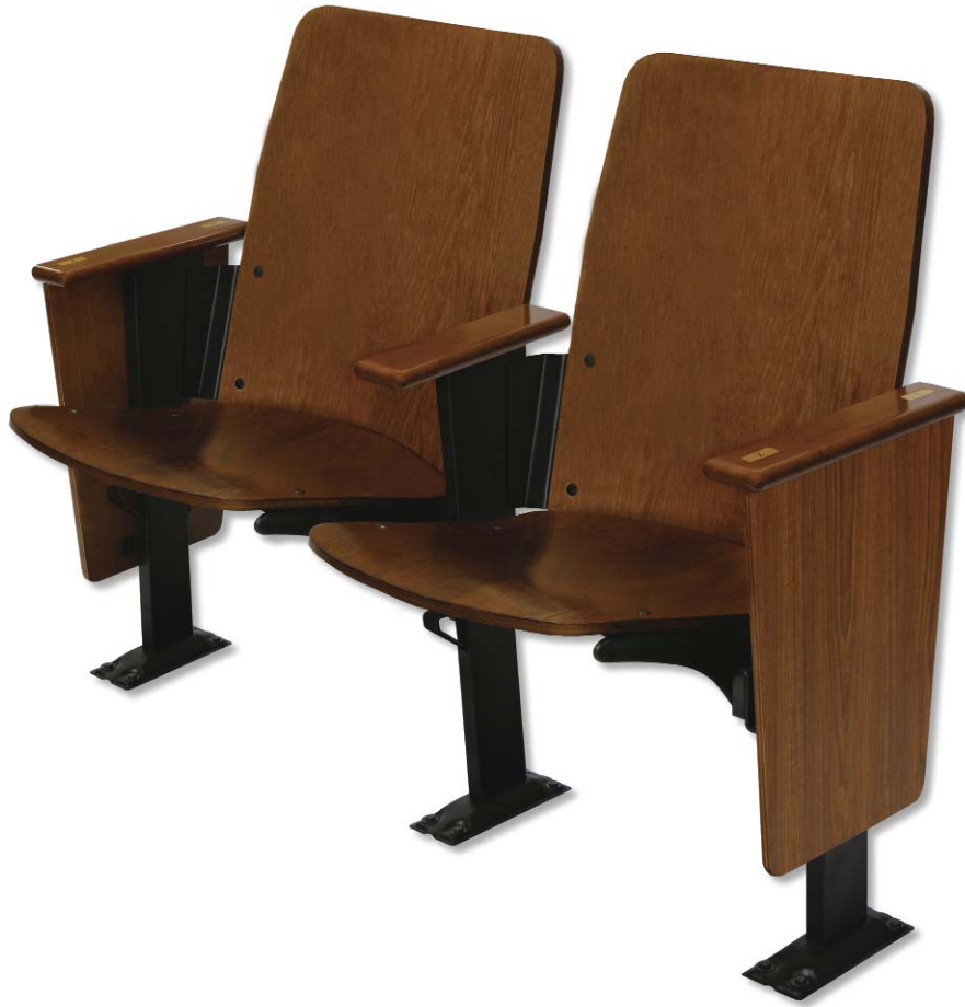
BQ 700 SCHOLAR