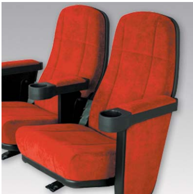
OPTIONAL STITCH PATTERN