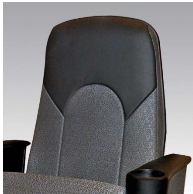
OPTIONAL STITCH PATTERN